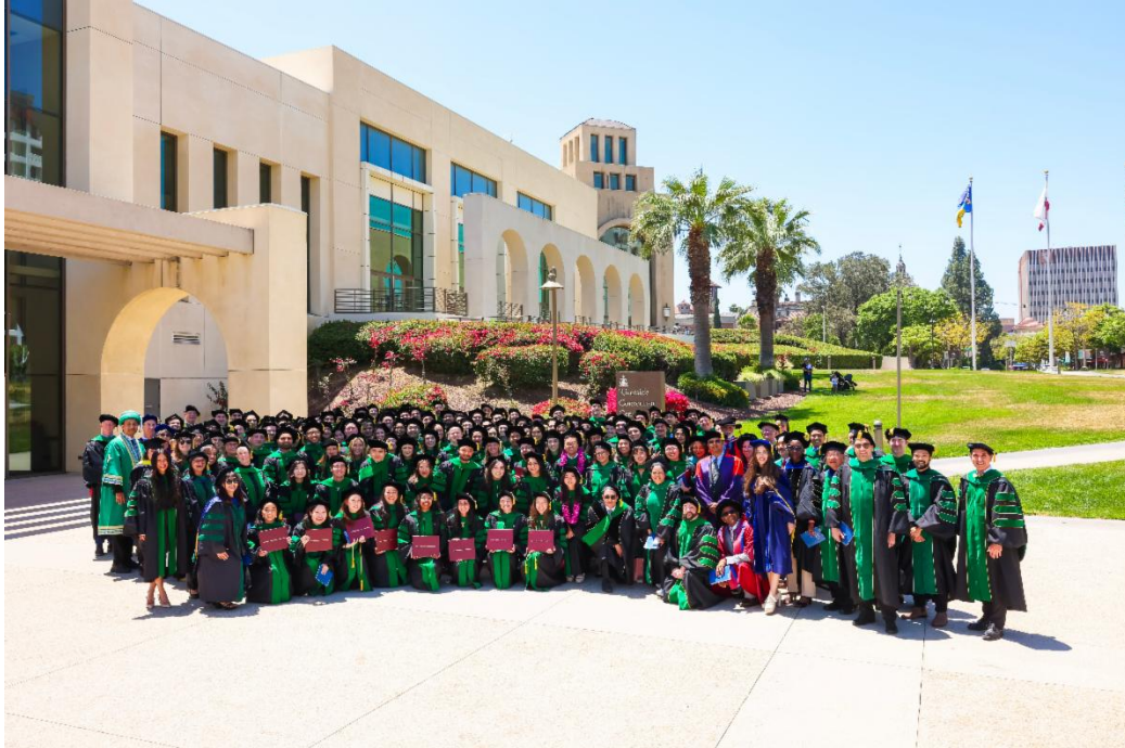
CUSM faculty and board members, along with the graduating class of 2025, at the Riverside Convention Center.